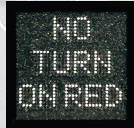
Pebble Clear Lens, White LED