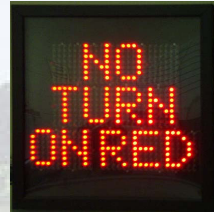
Black Lens, Red LED

Standard Black Powdercoat or Natural Aluminum Clear Coat. Custom colors available on request.