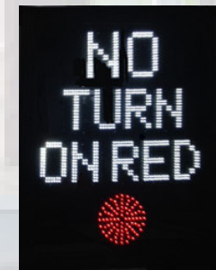
24 x 30 Black Lens